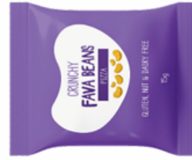
Roasted fava beans