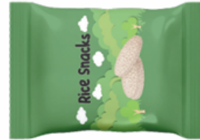
Mini rice wheels